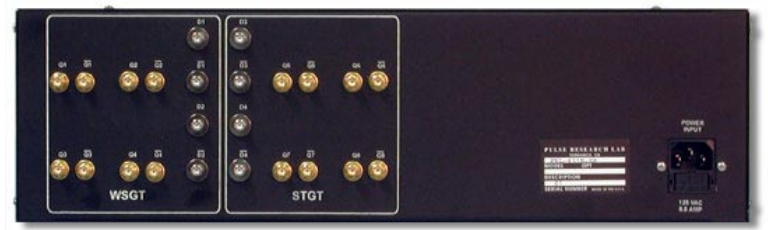
PRL-431N-S8 Rear View