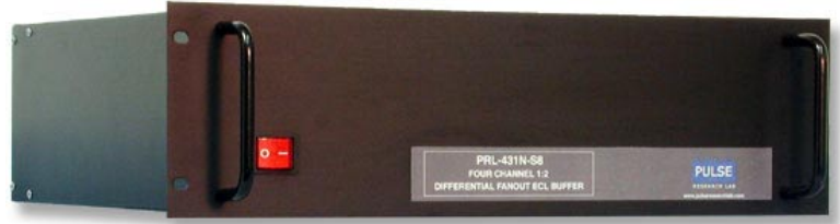
PRL-431N-S8 Front View